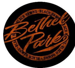
4" Glass Coaster