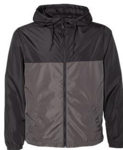
Jacket (front polo print)