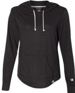
Ladies Hooded LS