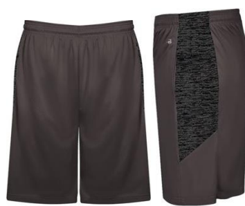
Performance Shorts (leg print)