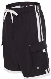
Swim Trunks (leg print)