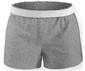
Softie Shorts (junior fit) (leg print)