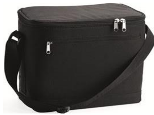
Cooler Bag (12 pack)