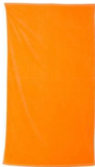
Beach Towel (Velour 30x60) (print on one end)